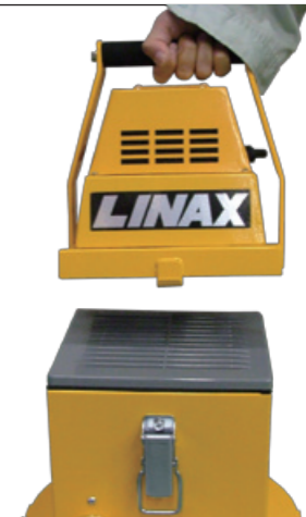
Catch clip system for easy filter replacement