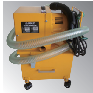
Handy, robust and portable. Easy mobility in congested jobsites