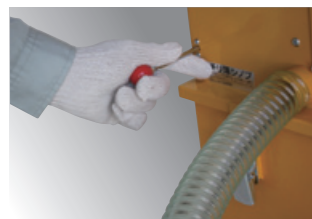
Anti-clogging filtration system with easy manual filter cleaning