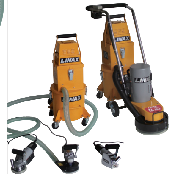
Works with a combination of handheld tools and compact walk-behind grinders