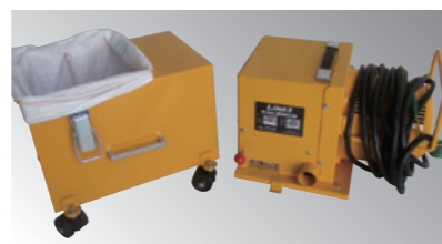
Faster and easier dust dumping