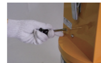
Anti-clogging filtration system with easy manual filter cleaning