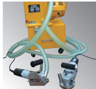
Works with a combination of handy grinders