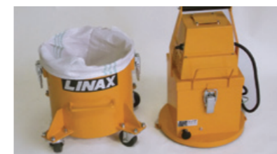
Faster and easier dust dumping